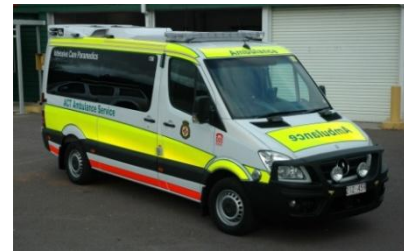
Figure 8 – An effective fluorescent and reflective multi-level layout applied on a white base color

I am sure over the years everyone has seen an emergency vehicle with the customary two inch reflective stripe running along its length plus a few words of text on the sides. This layout is easily overlooked and is of little help communicating the size, shape or length of the vehicle to an observer. By comparison, a broad waistline-height stripe in a single color is easily seen by drivers looking through the windscreen and side windows of their car. High roof-line stripes remain visible while moving through heavy traffic and a colored panel on the hood will attract more attention in rear-view mirrors. The bright stripes very quickly deliver information about vehicle length and height to other drivers. Arched cut-outs over the wheels project and reveal the total size of the vehicle and any change-of-direction as the orientation of the arched silhouette changes.