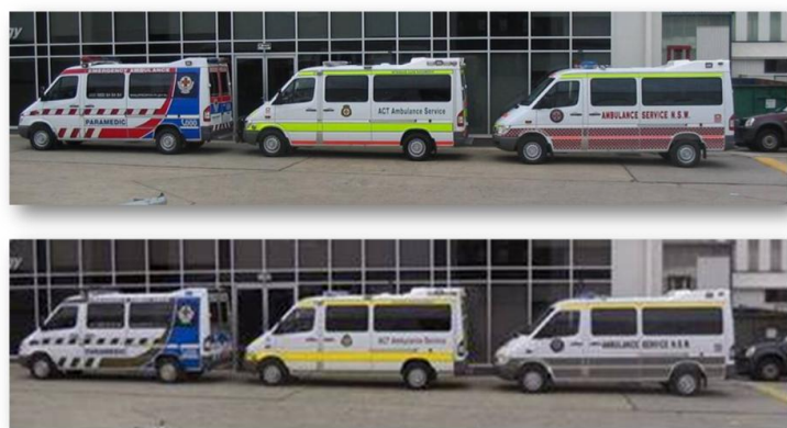
Figure 13 - Simulated comparison between normal and color deficient vision. Note only the centre ambulance retains high green-yellow luminance and the vehicle's appearance remains substantially unchanged

The inclusion of fluorescent and highly-reflective prismatic materials, contour markings and any artificially visual cues will always assist the visually impaired driver in reducing their recognition and reaction times. Darker colours and patterns with lower luminance levels and reduced contrast tend to blend in and are not seen as quickly. Preservation of the whole vehicle shape by the designer is essential and any haphazard patterns that persist can produce considerable delays in the recognition of emergency