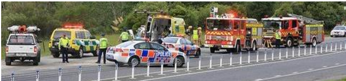
Figure 6 – A mix of different vehicle markings at an accident scene can be visually confusing to other motorists

It is essential that personnel and vehicles can be visually differentiated and separated from the total visual mass of the entire incident scene. Drivers in cars approaching a road accident must be able to rapidly weigh-up the scene ahead and negotiate a safe path through or around the incident. Dr Stephen Solomon made a valid point when he stated, "anything that lengthens reaction times increases the chance of an unwanted event."