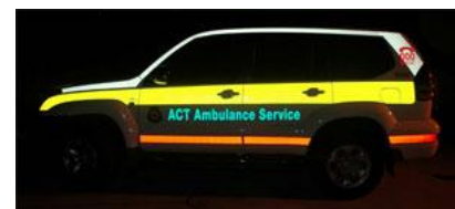
Figure 3 – The fluorescent waistline stripe, red baseline stripe and white contour markings combine to accurately & rapidly inform other drivers of the shape, size and orientation of the emergency vehicle

1. Motion/Speed: Fast-moving vehicles will usually be seen earlier if they stand out against the slower vehicles around them or if they are seen against a plain background. The vehicle speed also determines how much time is available for the decision-making process and collision avoidance.