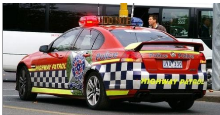
Figure 11 – A complex hybrid design akin to camouflage. It is not Battenburg, not high-visibility and definitely not safer.

The truly conspicuous high-visibility designs are simple, clear and easily understood. Designs that include large images, graphics, angular lines, complex patterns, alternating colors or oversize text all add together to create visual camouflage. For example, Canadian research 11 has proven that the NHTSA alternating red/white 'conspicuity' pattern for heavy vehicles in the US is inferior to a solid yellow or plain white stripe under most weather conditions. In the same way, the Full Battenburg high-visibility checker pattern 12 used by the British emergency services on high-speed motorways was found during testing to be less effective within a complex urban environment. Subsequently, the simplified Half Battenburg design was created for use on vehicles working within built-up areas:- use Battenburg with care.