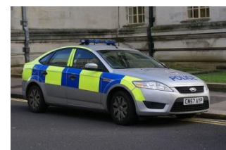
Figure 12 - Half Battenburg

You should also be aware that the value of the rear-facing inverted-V chevron pattern adopted by default in the UK has never been independently assessed or tested. The chevron design has been embraced by many national agencies along with standards organisations, mostly on the hearsay of popular opinion. The traditional Sillitoe pattern (small checkered squares) is not a high-visibility pattern at all. It is being hybridised by EMS and their favoured graphics firms into many different permutations, all described as 'a new era in safety markings'. It is becoming clear that agencies need to remove any photo-murals, oversize Star-of-Life decals or agency logos, along with any checked, wavy or angular patterns on their vehicles to simplify their marking layouts.