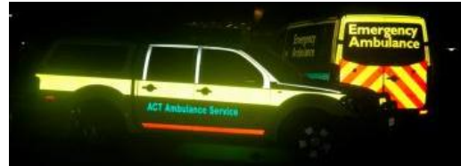
Figure 10 – An ambulance SUV displaying visual cues to assist recognition and an ambulance with half height chevrons & oversized text decaying to clutter

A broad waistline stripe should always be positioned so the semicircular cut-outs over the wheel arches obviously protrude into the marking material. These cut-outs increase the capacity of other drivers to gauge size, distance and orientation of the vehicle as it moves through traffic. Some states legislate that certain colors must always be fitted eg. red reflective must appear only on the rear of vehicles. The drivers in these states learn over time to quickly identify vehicle orientation by recognising a particular color.