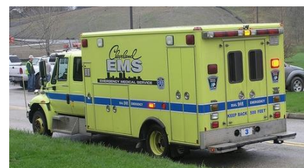
Figure 7 – Ambulance painted in high-conspicuity yellow-green paint

Consider all the colours of the landscapes within your local area of operations. The choice of vehicle colour becomes more difficult for complex urban landscapes or cityscapes, especially if an agency provides services within both city and rural environments. Make sure your chosen colour will suit all the vehicle types in your fleet, including ATV's, boats and aircraft. By default, yellow-green, chrome yellow or the European RAL 1016 paints are ideal for maximising visual safety as the bright colors match the peak sensitivity of the human eye. Vehicles with a complex appearance should be painted one colour to maintain form and singularity. White is a suitable safety color only when partnered with bright fluorescent materials. It may seem fairly obvious to avoid using white vehicles in snow regions but if you have no choice (or are retrofitting older vehicles that are white) then the application of large fluorescent panels or wide stripes is an effective option.