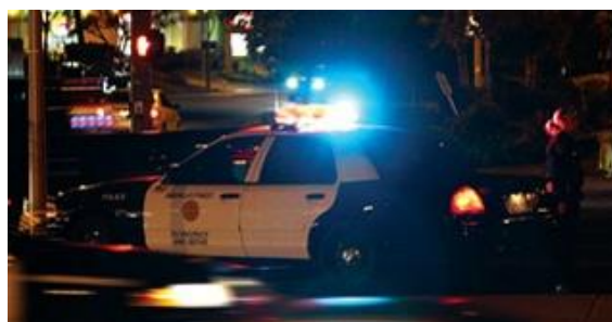
Figure 1 - A Black & white police cruiser on a city street appears half-hidden in the shadows

The widespread return to traditional vehicle colours is not restricted to police in the United States. There are numerous Fire Departments around the world that have canvassed staff for their opinions and as a result, are once again painting their appliances fire-engine red. EMS agencies are returning to the older and less conspicuous range of body colors that today include blue, brown, green and purple. Even more surprising is the recent trend towards painting ambulances and fire trucks in stylish gloss black; all these darker colors have been shown in a Monash University (Australia) study 1 to increase the risk of an accident.