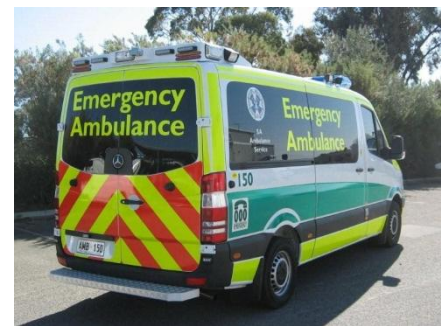
Figure 12 - Oversized text and logos corrupting the visual profile of a Sprinter ambulance. Compare this vehicle to the vehicle in Figure 8.

We have all seen an agency name on a vehicle printed in huge gold lettering. Oversized text covering large areas of a vehicle equates to camouflage when viewed at any distance. It has been proven in research that text using sentence-case (eg. Intensive Care Ambulance) is easier and faster to read, especially at longer distances. Letters in BLOCK CAPITALS tend to merge into each other at distance and reflective block letters are also significantly harder to read at night, especially for individuals with impaired vision. In Australia, the small area available for sign writing on the sides and rear of Sprinter van bodies has driven some states to cover most of the windows with large text and logos. This is a common error which can also obstruct the driver's view.