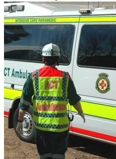
Figure 14 – A two colour safety vest with H-pattern white reflective tape. Note the long extended tail that provides extra visibility while bending down to treat patients

Several years ago when working on vehicle markings with Summit County CO it was decided the ambulances should be marked-up in yellow fluorescent material. This was in deliberate contrast to the lime-green safety vests worn by staff. Airport Fire Fighting and Rescue in Australia wear oatmeal coloured turnout gear in opposition to their yellow-green vehicles. Another option for night work use is to fit vehicles with reflective yellow markings while the vests worn by personnel shine a bright white.