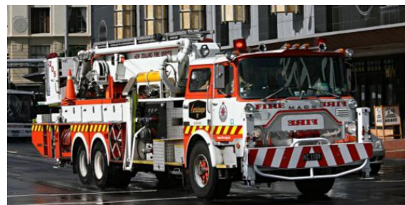
Figure 2 – Chevron “visibility” markings combine with a red/white color scheme to effectively camouflage a fire appliance, making it difficult for drivers to quickly determine the size, shape or orientation of the vehicle.

4. Recognition describes the ability of an observer to attach meaning to particular shapes and colors. The popular Battenburg or chevron markings may be considered as recognition patterns, however only one or two of the latest recognition patterns can be accurately labelled as high-visibility markings. You can identify fire trucks by their unusual shape but recognition can actually take longer if the popular but ineffective types of 'visibility' markings disguise the vehicle outline. It is very easy for haphazard designs and motifs to induce camouflage effects whenever the vehicle is viewed against a complex cityscape or in low-light situations. Any visually confusing feature on a vehicle will actually increase the time required for the viewer's cognitive functions to analyse the subject detail, plan a response, and then react, all within good time.